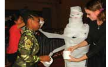
Kids work together to create a "mummy" out of a teammate during the Mummy Wrap contest at Woodbridge Youth Services Halloween Bash. The program is co-sponsored by the Town of Bethany. The Bethwood Bash program is open to all Woodbridge and Bethany 7th and 8th grade residents. Private school students are encouraged to attend.