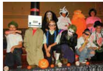
The costume contest during the recent Halloween Bash was a real fright! Costumes were judged in four categories: scariest, most fun, most original/home-made, and adult pick. The Halloween Bash included a Boppers DJ, a costume contest, a mummy wrap contest and a donut eating contest as well as pizza and snacks. Many thanks to all the parent volunteers who help make these programs a success!

THE PERFECT COMPANY PROMOTION | GIVEAWAY!