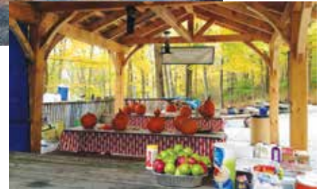
Photos taken at Camp Whiting Cub Scout Pack 902 fall camp out, October 24, 2015