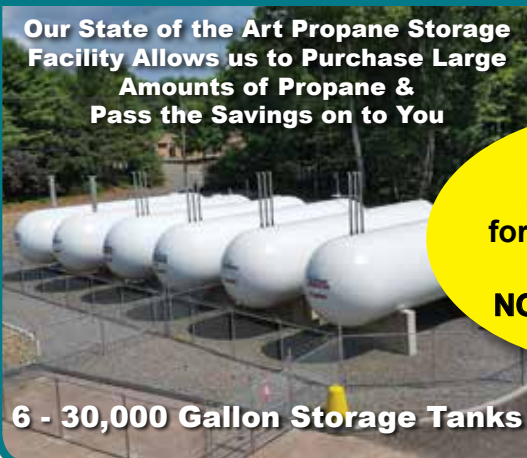
6 - 30,000 Gallon Storage Tanks

Our State of the Art Propane Storage Facility Allows us to Purchase Large Amounts of Propane & Pass the Savings on to You